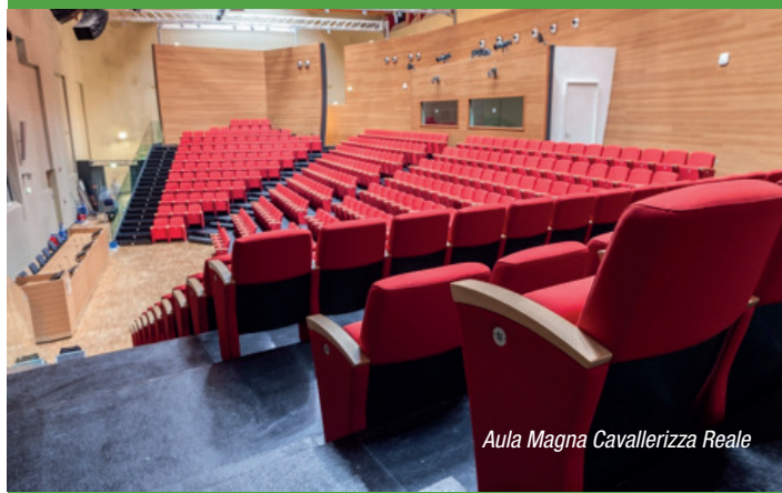
Aula Magna Cavallerizza Reale