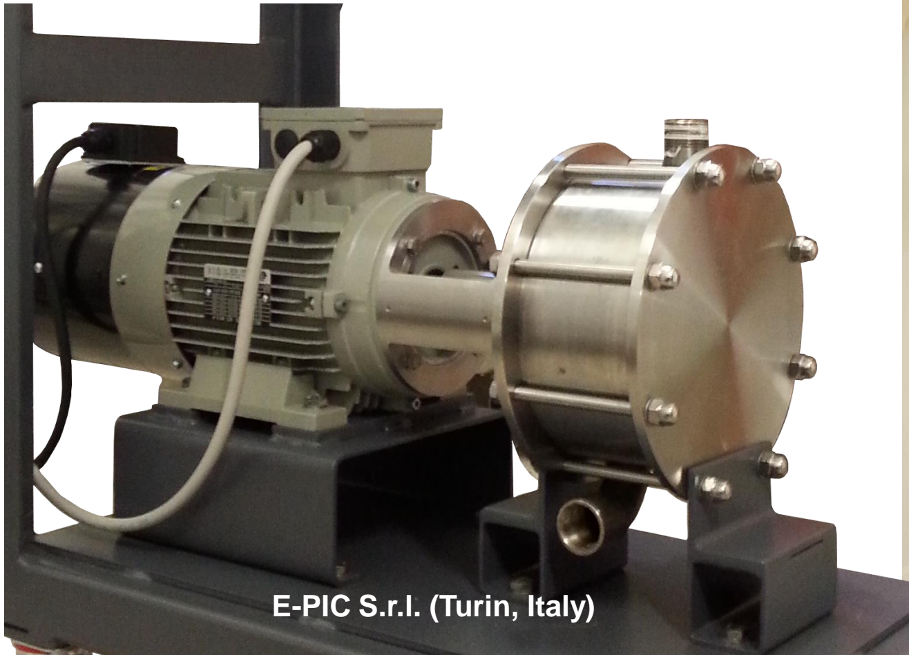
E-PIC S.r.l. (Turin, Italy)